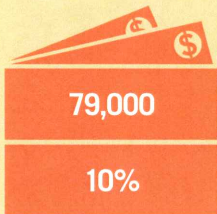
Children With at Least One Unemployed Parent: 2010