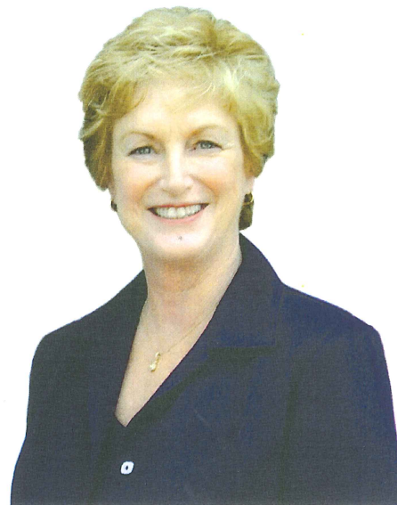
M. Jodi Rell Governor