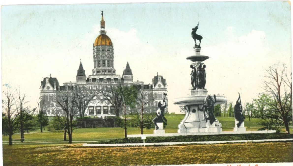
Corning Fountain and State Capitol.