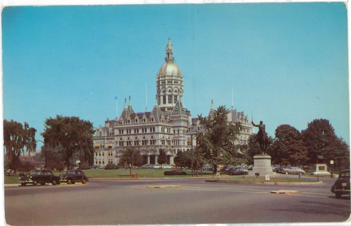
5 THE STATE CAPITOL at Hartford, Conn. in Bushnell Park. It was built in 1877 and is of modified French Gothic design.