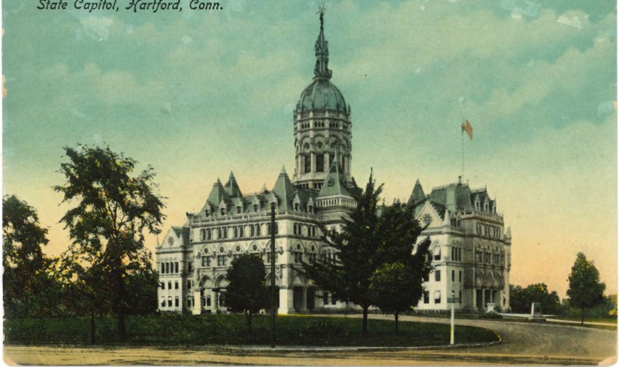
State Capitol, Hartford, Conn.