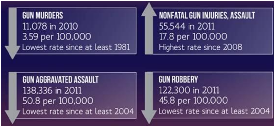
National Instant Criminal Background Check System (NCIS) vs Violent Crime.