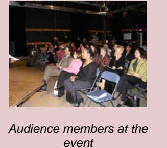
Audience members at the event

This PBS documentary explored how population health is shaped by the social and economic conditions in which we are born, live and work through portraits of individuals and families across the United States. The PCSW's Connecticut Women's Health Campaign hosted audience participants for the showing of In Sickness and in Wealth .