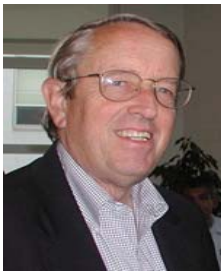
The 2008 Robert Haller Memorial Award for Outstanding Community Service

Participants practice civic skills by working on an issue of concern in their community. They write a report describing their efforts utilizing democracy skills taught in the PLTI curriculum. These projects become part of the local PLTI's resource library. The alumni, in conjunction with the design team, provide mentoring and support for continual civic leadership. Please join us in Hearing Room 1B to view the Class of '08 community projects.